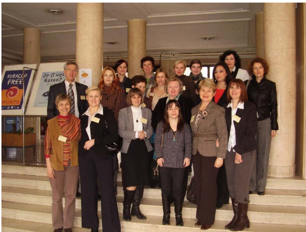
Sub-regional meeting for South-Eastern Europe in Sarajevo

Pilot work started in September/October 2008 and is progressing well. In Bosnia & Herzegovina, the Czech Republic, France and Turkey, data collection with the policy analysis tool is now completed, and sub-regional meetings with local and regional experts and stakeholders have taken place to obtain feedback on the usefulness and applicability of the tool for each respective sub-region.