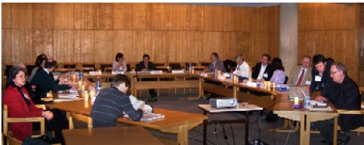
Sub-regional meeting for Western Europe in Marseille

Partners from these countries are thus currently finalising the analysis of the data and are collating all the information into the planned deliverables. In Latvia, the Policy Checklist has been completed and data collection with the Community Questionnaire is making good progress; the sub-regional meeting will take place in April. All partners involved in pilot work are also getting ready to present their result at the 2 nd EURO-PREVOB Plenary meeting (see details below).