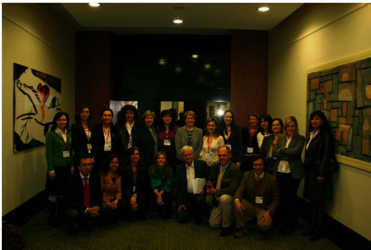
Sub-regional meeting for Southern Europe in Ankara